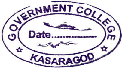
Name and Signature of the Principal Dr. Ananthapadmanabha A.L.

These water conservation measures not only make the butterfly garden a thriving ecosystem but also serve as an educational tool to promote sustainable practices among students and visitors. They reflect our commitment to responsible environmental stewardship and the preservation of precious water resources.