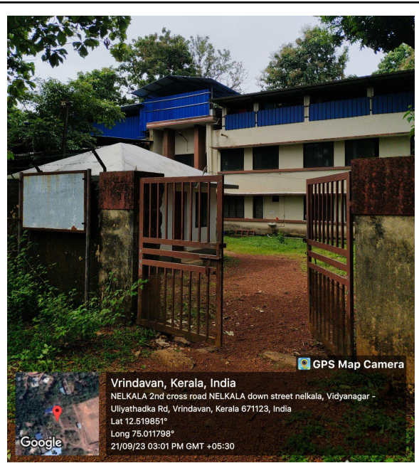
Old Block of Girls Hostel