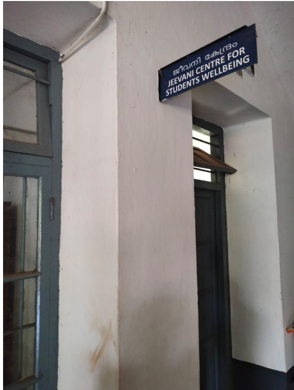
Display boards of Jeevani Center