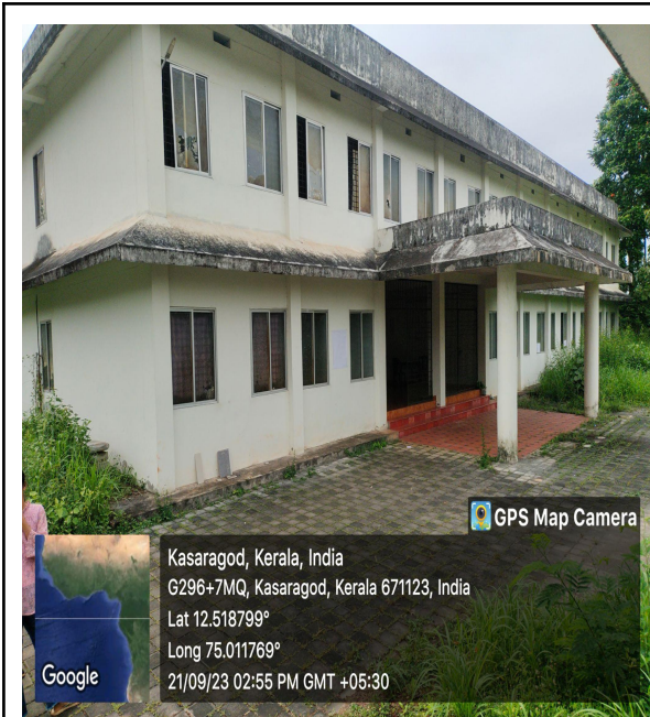
New Block of Girls Hostel