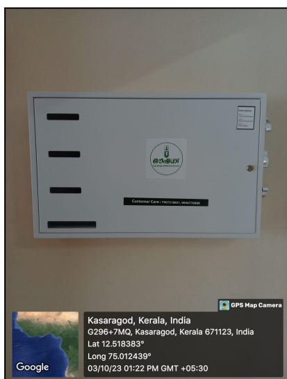
Sanitary Napkin Vending Machine

Together, these facilities contribute to a comfortable and hygienic environment for our female users, promoting menstrual hygiene and convenience. We are committed to providing essential amenities that prioritise the well-being and dignity of all individuals using our facilities.