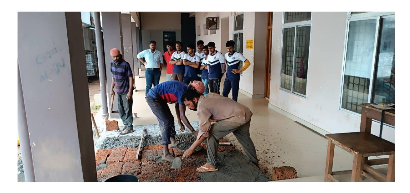
Construction of RAMP for differently abled students to differently friendly toilet