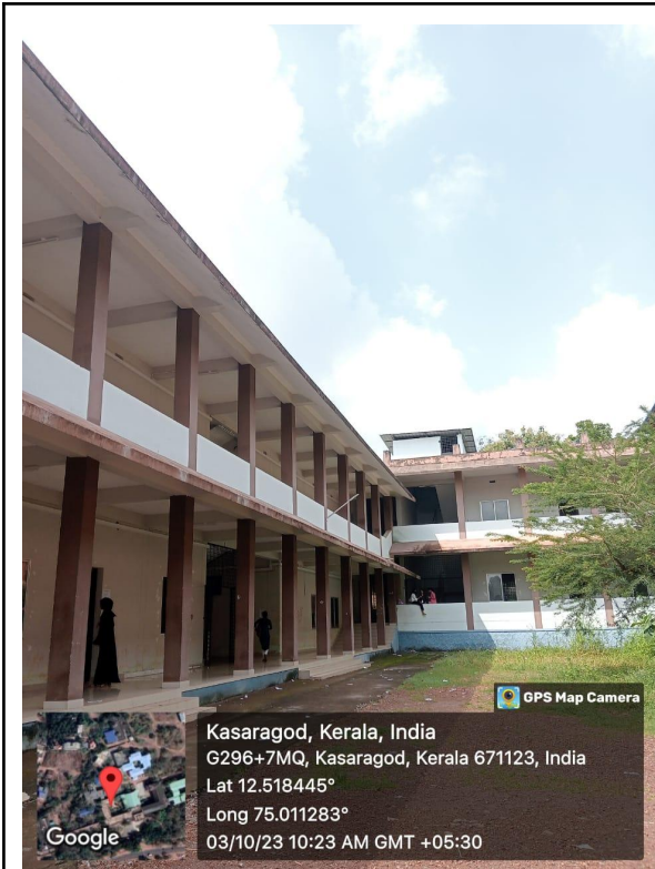
CENTER OF EXCELLENCE