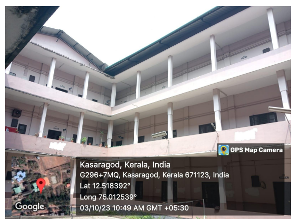
OLD SCIENCE BLOCK