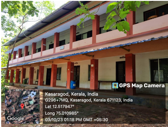
OLD PG BLOCK