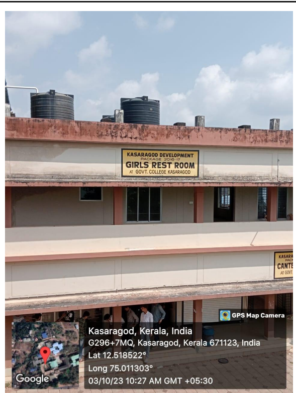
GIRLS REST ROOM