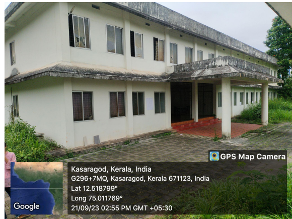
UG GIRLS HOSTEL