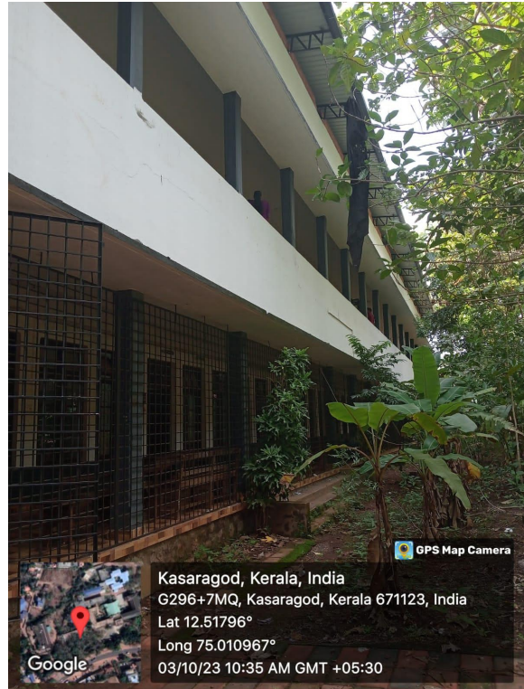
ARABIC KANNADA BLOCK