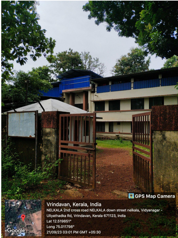
PG GIRLS HOSTEL