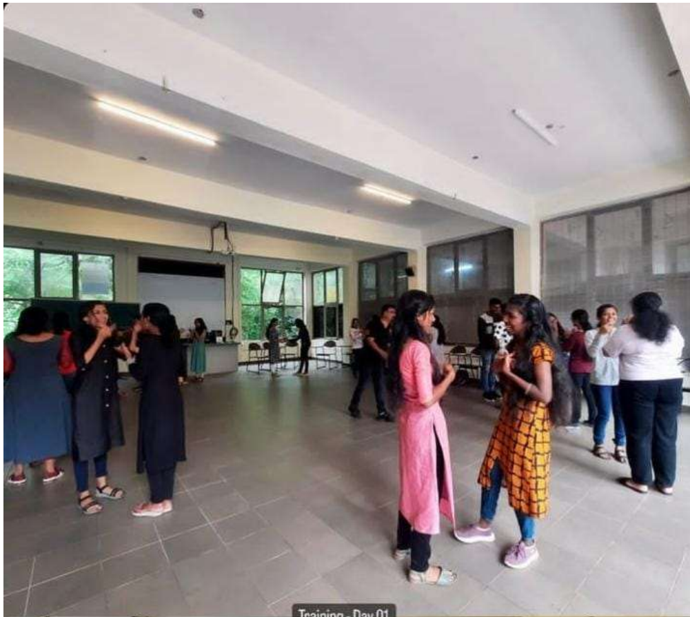
Training - Day 01